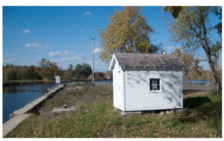
New Lock Tender's Shanty

text included a reference to a wrecked boat at the falls. It was determined that this wreck predated the one in the Lock 10 tale.