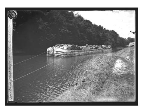
image of a load of wood coming down the Old Champlain Canal heading for the Northumberland Bridge

Most of the references found indicate the Lock Tender's name was Elijah. The Plattsburg Sentinel, stating that the tragedy occurred in 1869 appears to be accurate. An event in the Champlain Canal Legal and Historical Events 1791 - 1905 states: "1869 Saratoga dam partly carried away during a great freshet". There were no references to repairs to the area in the entries for 1872. Since damage, due to high water, occurred in 1869 but not in 1872 and the story teller placed the flood and the tragedy in the same year and was wrong about the fate of Elijah, it is logical to conclude that the Sentinel carried the correct year.