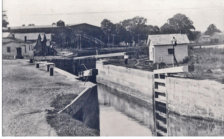
Old Canal Lock 10 around 1900

Volunteers at Hudson Crossing Park have cleared the area closest to the original location of the old lock and have placed a replica Lock Tender's Shanty on the site. Plans for the replica